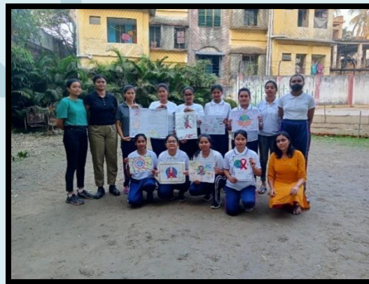
Sl.No.41 World AIDS Day