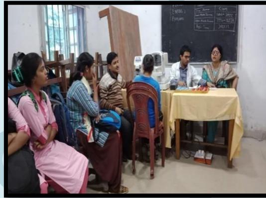
Sl.No. 37 Youth Day Celebration