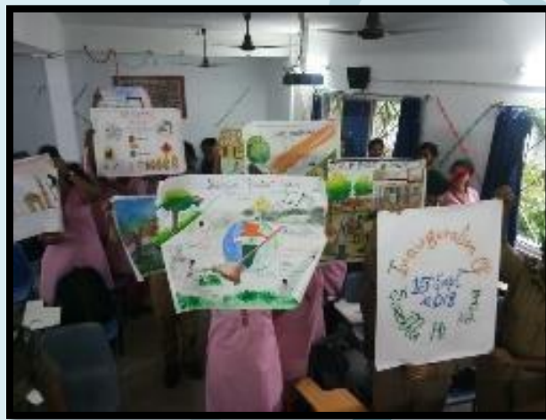
Sl.No.15 Swachhta hi seva