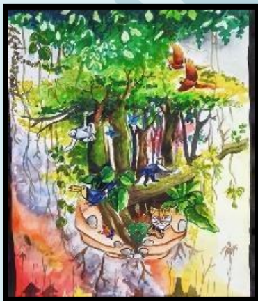
SL.No.7 World Environment Day