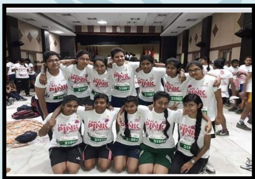
SL.No.32 5Km Race For Peace