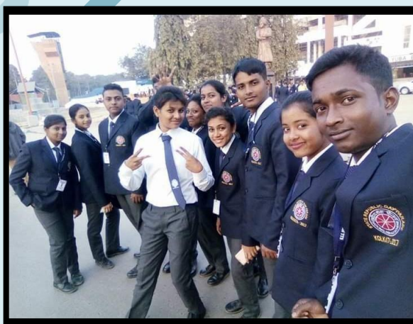
SL.No.39 LRD Camp

Smukhanje Teacher-in-Charge VIVEKANANDA COLLEGE FOR WOMEN