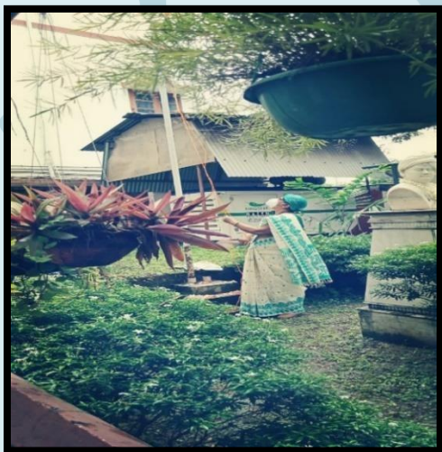
SL.No 33 Independence Day